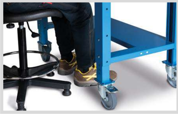
BENCH DESIGNED FOR AN ERGONOMIC SEATING