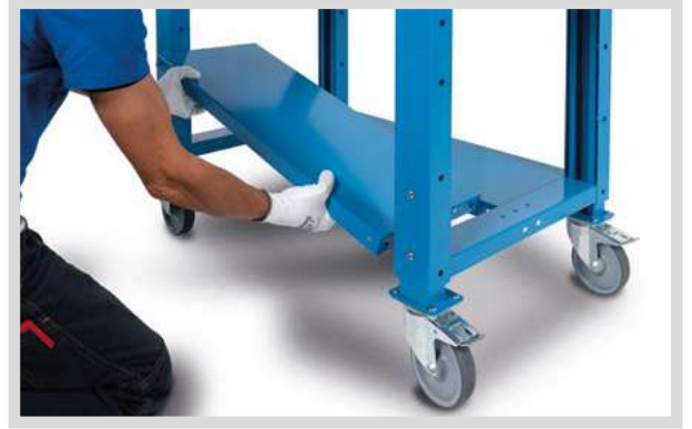
ADDITIONAL BOTTOM SHELF

The new STEEL bench presents a series of bottom shelves, that act as reinforcement for the whole structure. The addition of a second shelf completes the bottom support shelf.