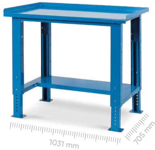
● ART. F BG S1R0 00 04 H = 740/1110 mm